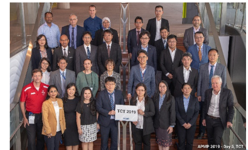
<APMP 2019 TCT photo>