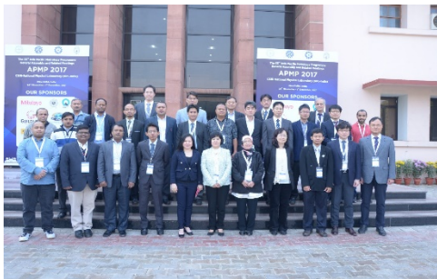
<APMP 2017 TCT photo>