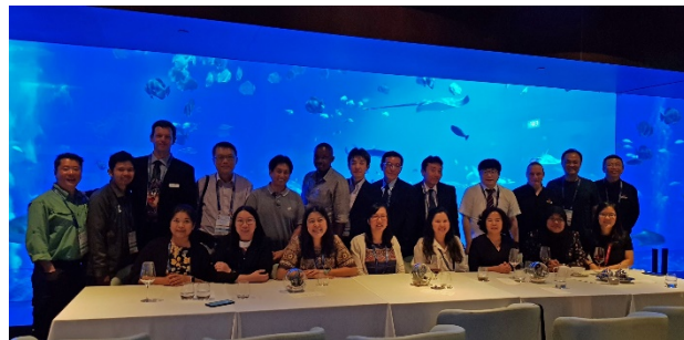
<APMP 2018 TCT workshop dinner photo>